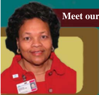
Meet our Board Chair

DATA SOURCES: 3: Academy of General Dentistry